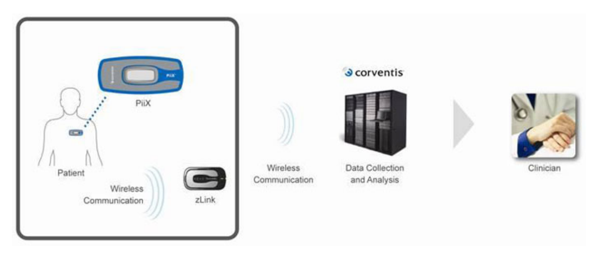
Figure 8: AVIVO Mobile Patient Management System